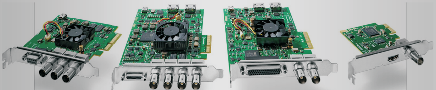
DeckLink Cards Input & Output on HD/SD-SDI-HDMI-Composite-S-Video

Playout software enables to receive the viewer choice and play song accordingly. Attractive Screen view to the Channel. Flash overlays allows to catch viewer's attraction. Facility to design your screen with different flash and image overlays. Hide cinematograph by overlaying flash on it. It allows to Customize your Song image thumbnail.